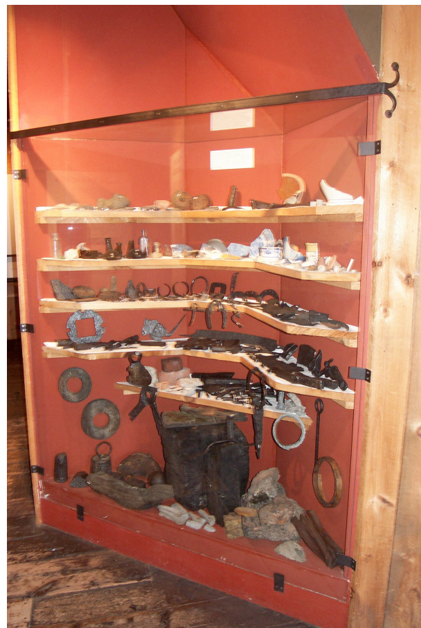
A collection of artifacts dug up on the Saugus Iron Works grounds.

Show students old pictures of the area. Ask students to identify the locations. Talk about how the locations have changed over the years. Talk about how clothing has changed.