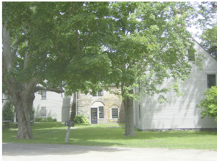
The Spencer-Peirce-Little Farm.